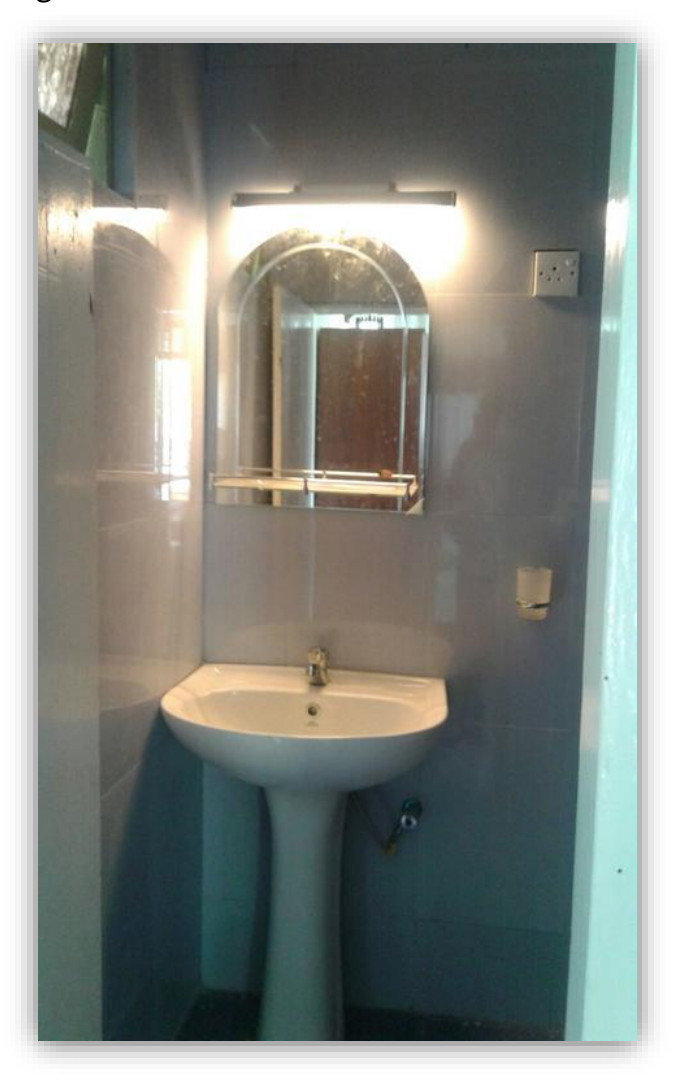
UPALLI WHITE HOUSE is aprox 8 km from BEACH VILLA LANKA which is also our property.